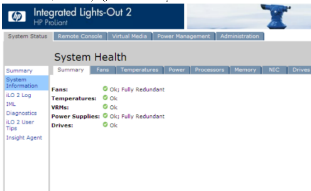
Figure 2: iLO Web GUI

Verify that hardware is correct; this would involve at least connecting to the iLO (using the Web GUI as below) and verifying no errors are reported.